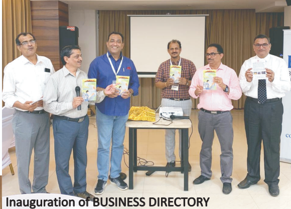
Inauguration of BUSINESS DIRECTORY

NON PROFIT NON RELIGIOUS NON POLITICAL REGISTERED ORGANISATION