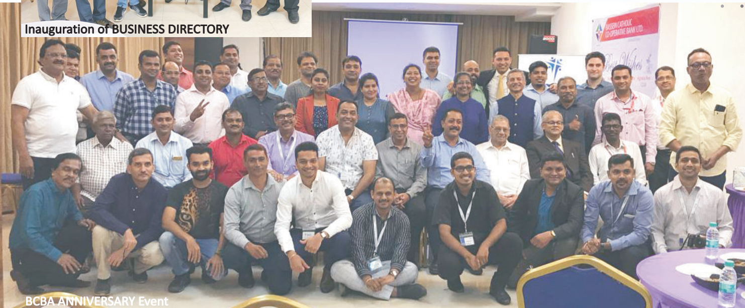
BCBA ANNIVERSARY Event